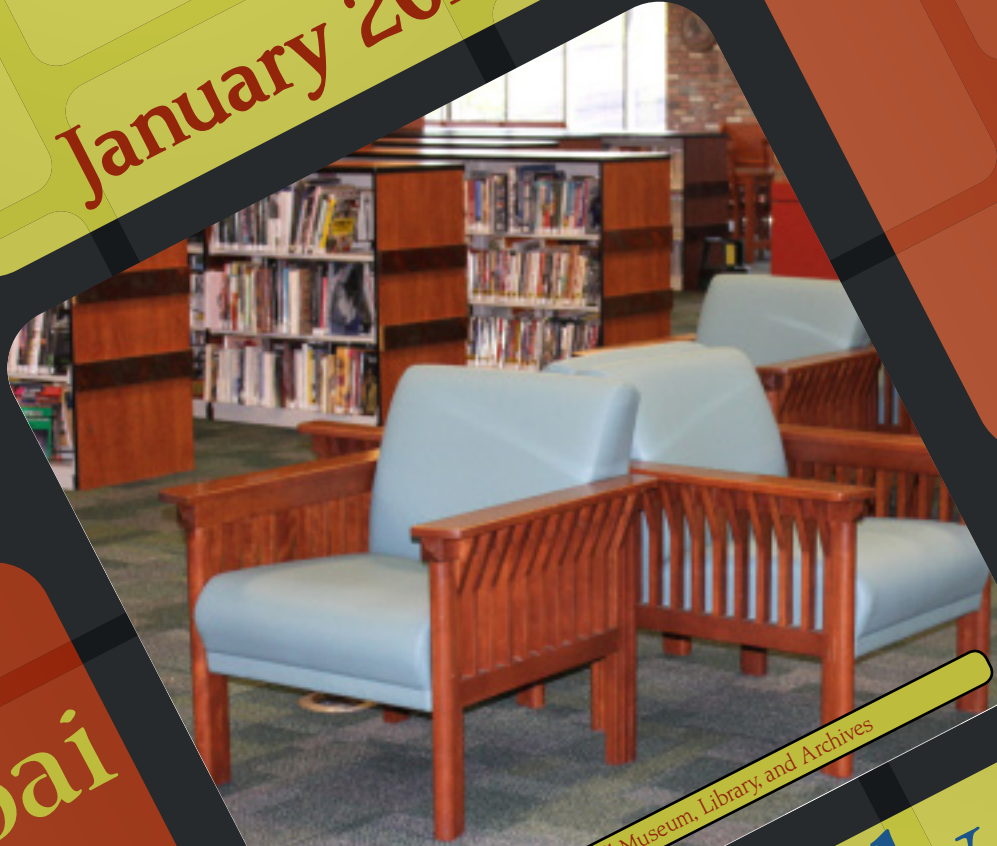
The Sharlot Hall Museum, Library, and Archives