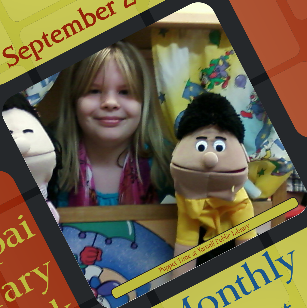
Puppet Time at Yarnell Public Library