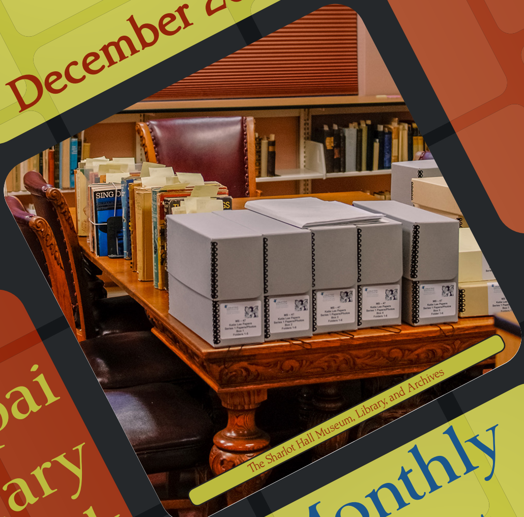
The Sharlot Hall Museum, Library, and Archives